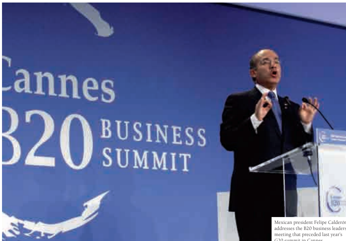
Mexican president Felipe Calderón addresses the B20 business leaders' meeting that preceded last year's G20 summit in Cannes

efforts to raise SME business integrity standards and identify good practices to facilitate the active cooperation between companies and enforcement authorities.