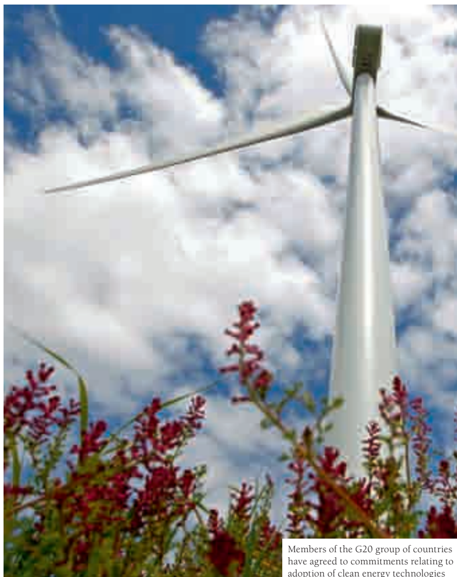
Members of the G20 group of countries have agreed to commitments relating to adoption of clean energy technologies

In response to the 2008 financial crisis and in an attempt to restore growth and prosperity, the G20 commitments from the Washington Summit in November 2008, the London Summit in April 2009 and the Pittsburgh Summit in September 2009 were