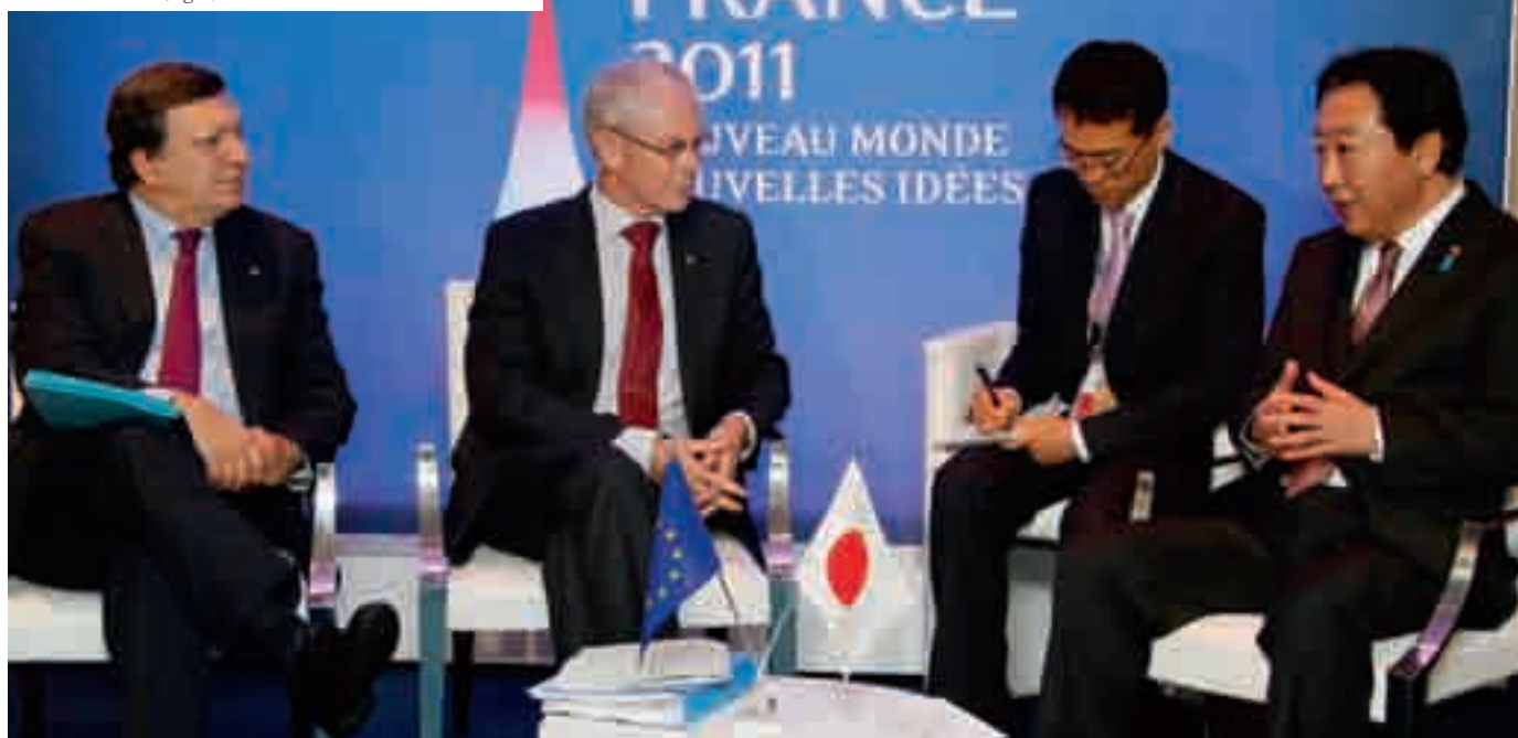
European Commission President Jose Manuel Barroso (first left) and European Council President Herman Van Rompuy (second left) meet with Japanese prime minister Yoshihiko Noda (right) at the G20 2011 Cannes Summit

its accountability shortfalls. Contrary to the G8, traditionally viewed as a global nexus of like-minded leaders, the G20's inability to consistently follow up on its promises is often attributed to its lack of a common set of universal values including the pursuit of democracy, support for human rights and a belief in free-market economies.