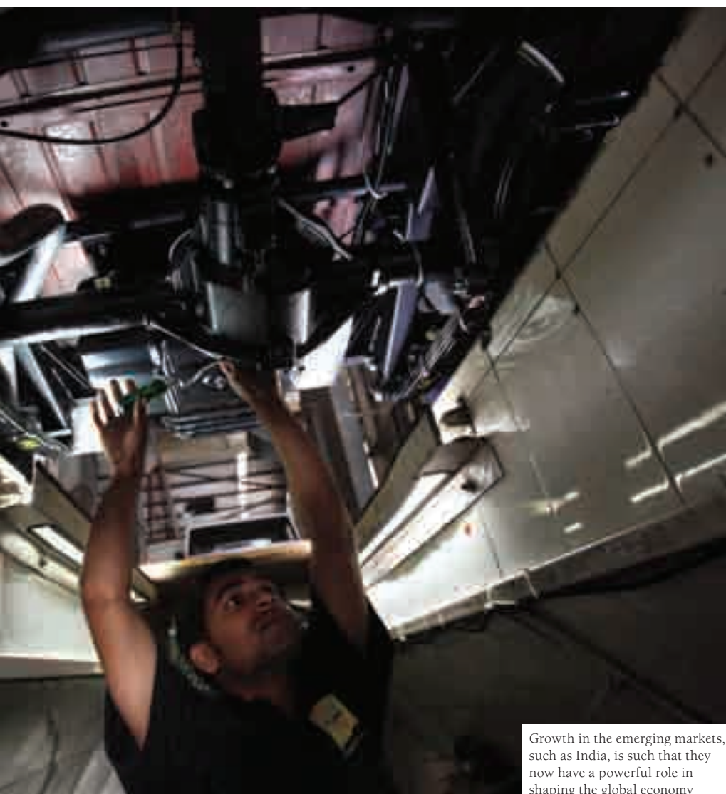
Growth in the emerging markets, such as India, is such that they now have a powerful role in shaping the global economy

The G20 enabled countries to pursue strategies that made the world better off when pursued commonly, but that might well not be in the interest of any one country