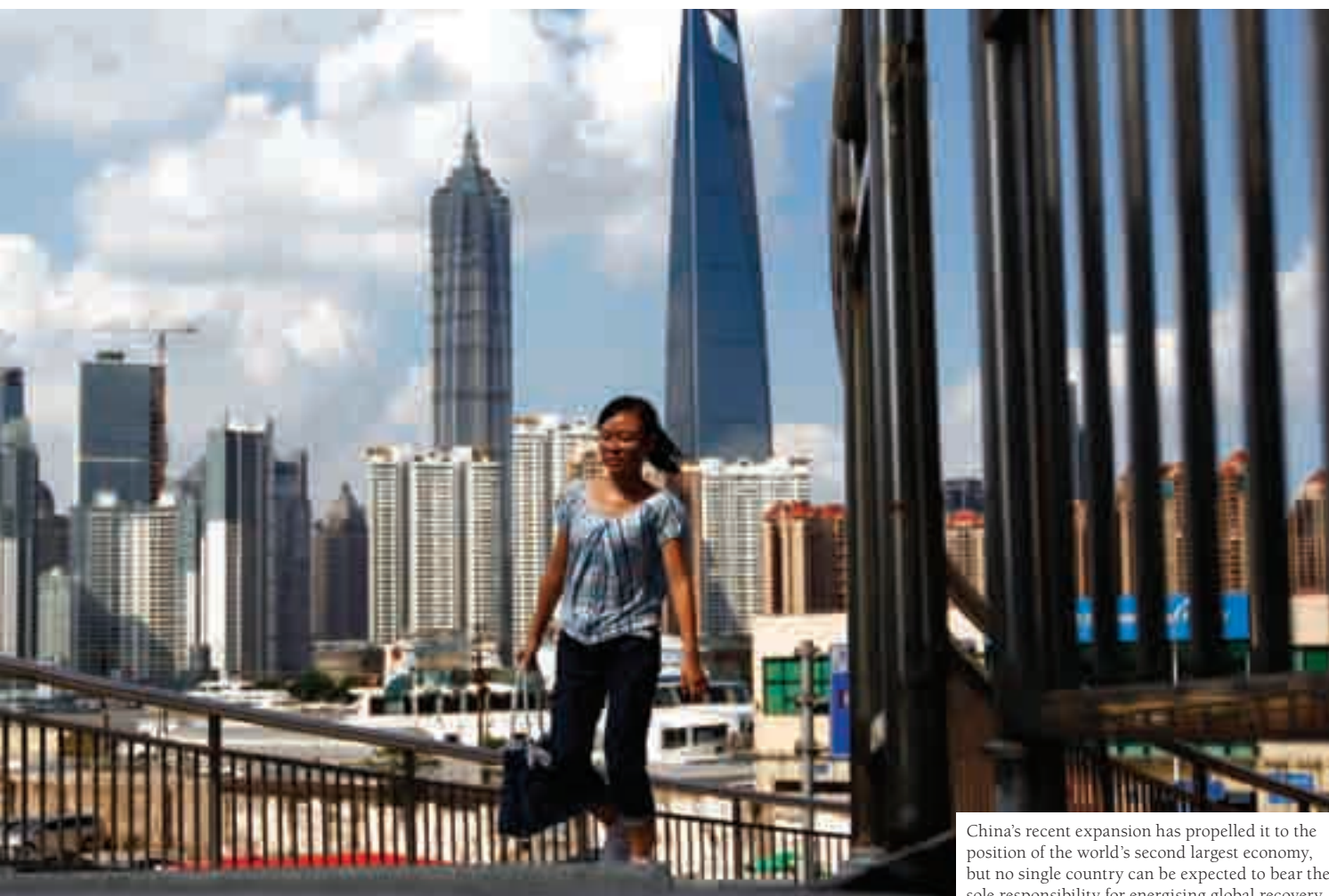
China's recent expansion has propelled it to the position of the world's second largest economy, but no single country can be expected to bear the sole responsibility for energising global recovery

policy, that are made especially by countries that play a stabilising role in the international system are key to good global governance. The ideal policy is one that is mutually beneficial to many countries, which could produce public goods. The second best public policy benefits only the country without damaging other countries. The third best benefits only the country and causes damage to others.