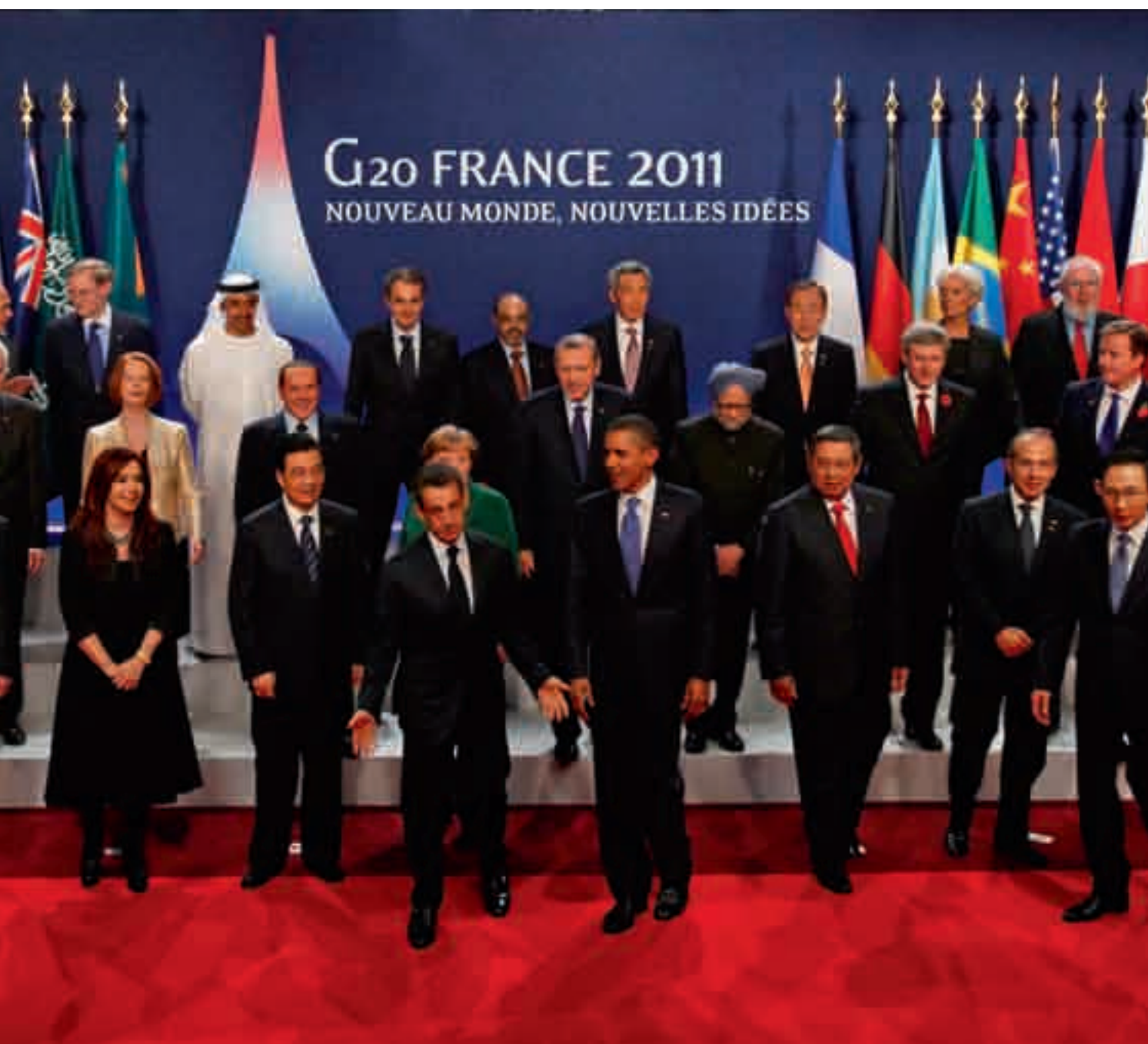
The G20 leaders who met in 2011 made a commitment to work together for financial stability, but have been accused of failing to follow up on promises