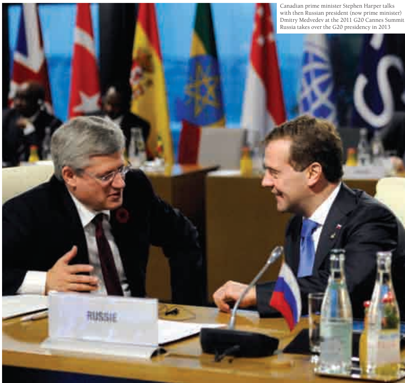
Canadian prime minister Stephen Harper talks with then Russian president (now prime minister) Dmitry Medvedev at the 2011 G20 Cannes Summit. Russia takes over the G20 presidency in 2013

mitigate volatility in agricultural prices and engage more effectively in managing energy prices volatility. Making restoring growth and employment levels a priority, Russia should boost attention to policies aimed at overcoming income disparities. This will prove G20 leaders' commitment to ensuring a fair and sustainable recovery.