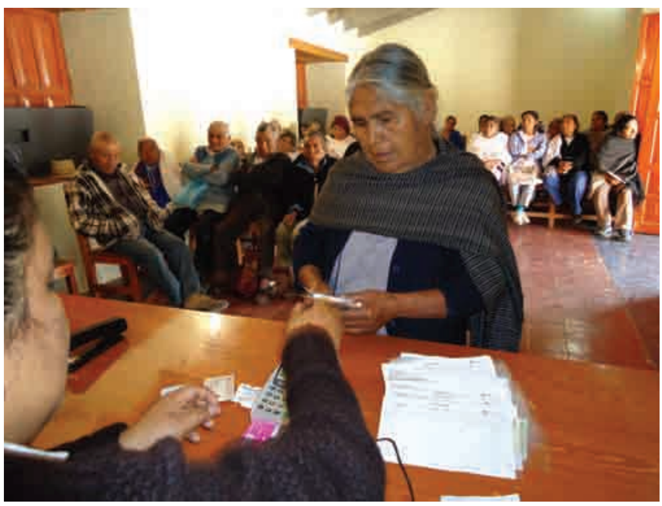
BANSEFI helps people on low incomes across Mexico to gain access to secure, dependable financial services