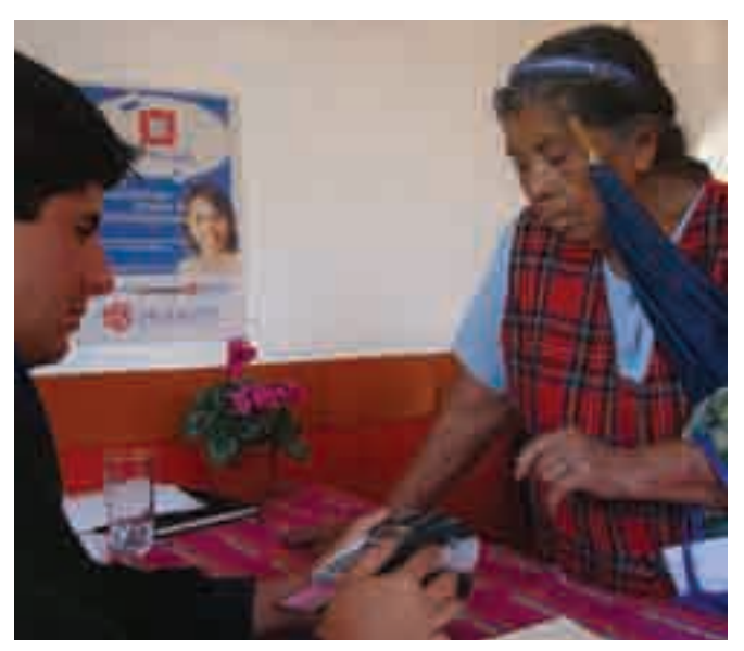
Mexicans needed a reliable way to conduct financial transactions

BANSEFI offers financial education workshops to members of the popular financial sector who, in turn, will be able to replicate