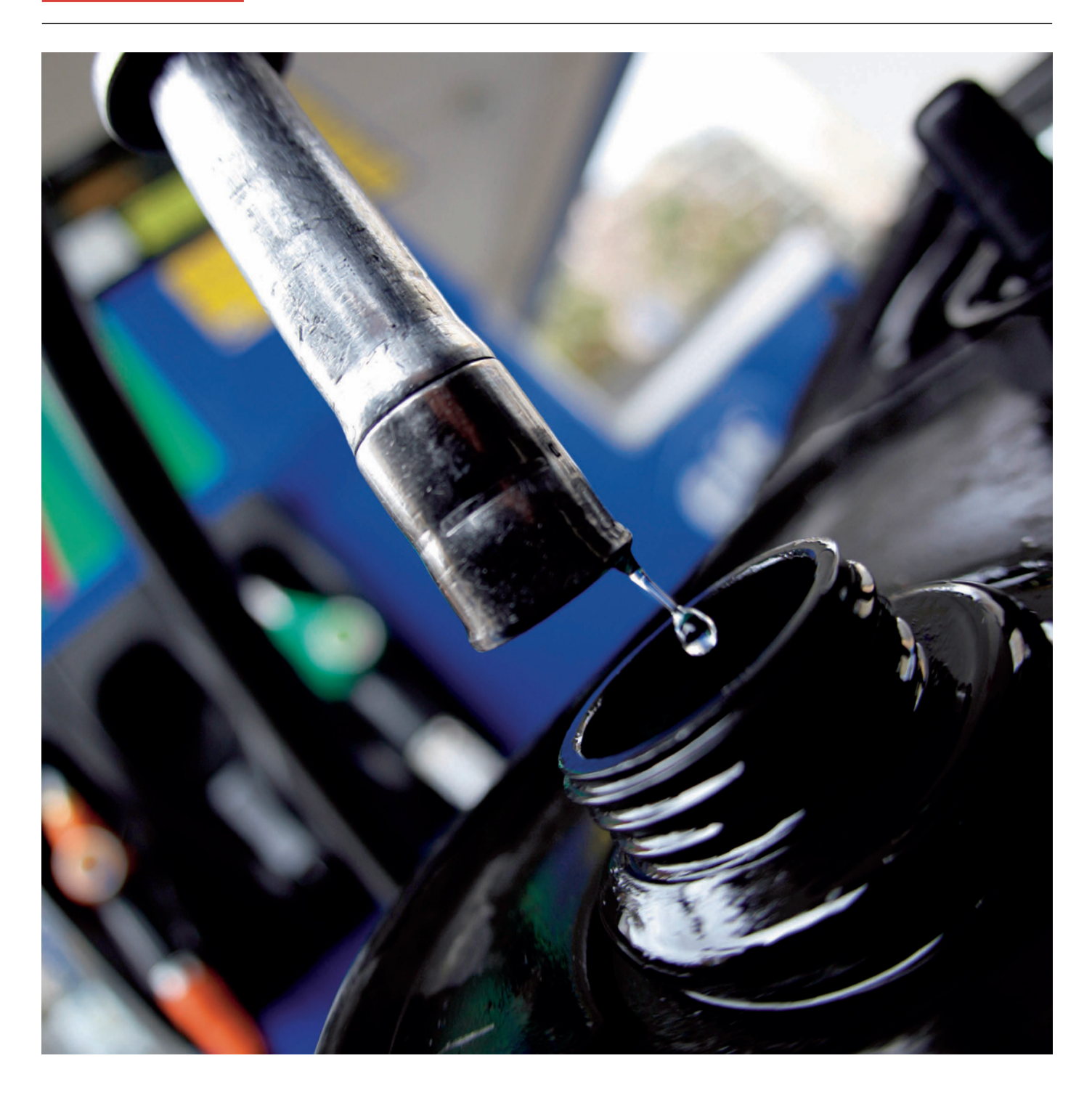
Filling up at the petrol pump. Future consumers may be recharging their electric vehicles, under an optimistic scenario

IEA estimated that fossil fuel subsidies amounted to $312 billion globally in 2009, down from $558 billion in 2008. However, with rising oil prices, early signs of inflation in some emerging economies and the impact of the world recession lingering, it is uncertain if this downward trend continued in 2010.