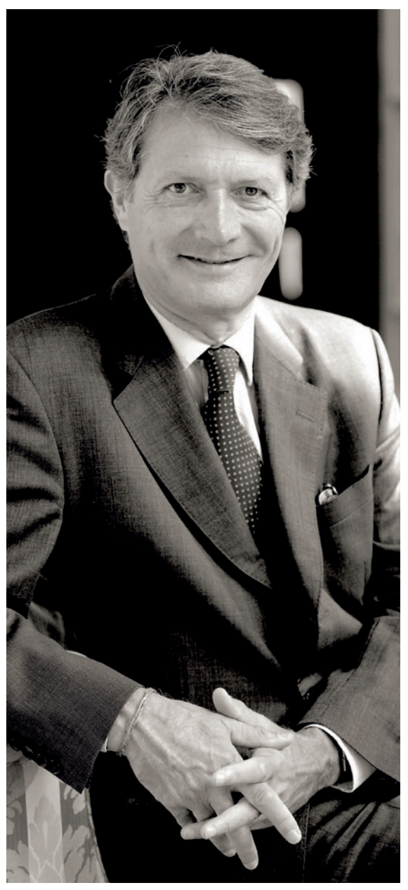
otor Guy Ice